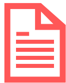
Health concerns (including chronic health conditions and life-threatening allergies)