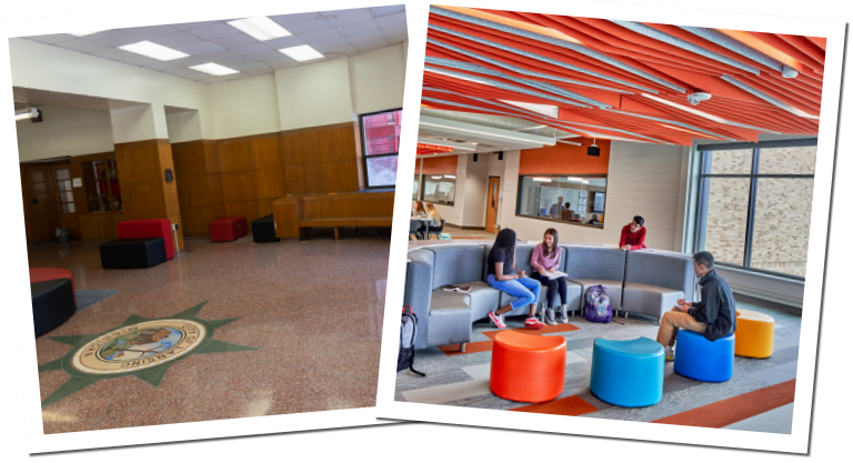
Sexton received the least investment of the three high schools during 2016's bond. This time around, it would be Sexton's turn. The left photo shows the existing building, the right shows new possibilities for this historic school.