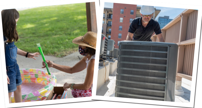
Delivering popsicles to schools due to lack of AC would be a thing of the past with this bond, which would provide AC to ALL classrooms district-wide.