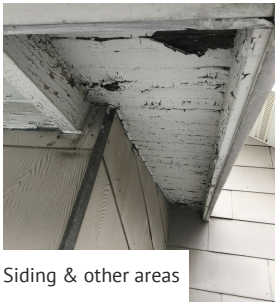
Siding & other areas