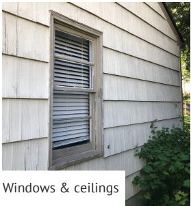
Windows & ceilings