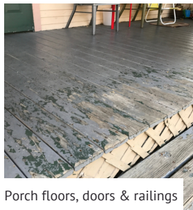
Porch floors, doors & railings