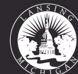
Andy Schor, Mayor

Through Lead Safe Lansing, grants are available to remove lead dangers for homeowners, rental property owners, and tenants.