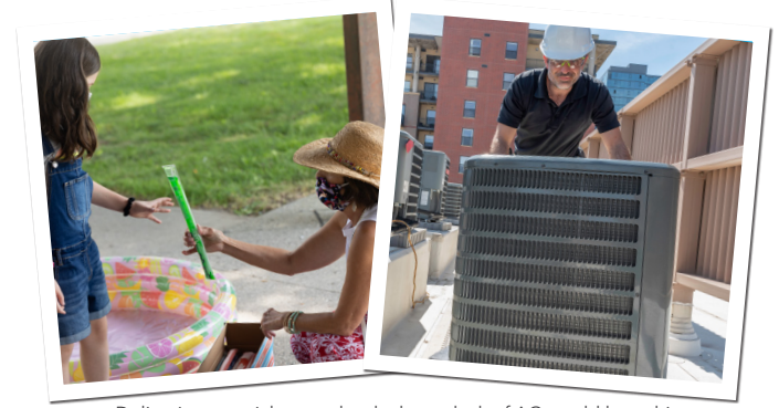
Delivering popsicles to schools due to lack of AC would be a thing of the past with this bond, which would provide AC to ALL classrooms district-wide.