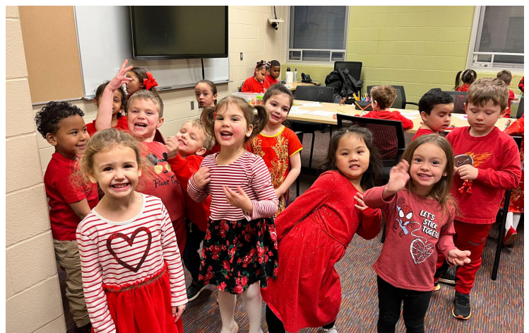
Our preschoolers rocked it during the performance!!!

Please sign up for our 2nd parent-teacher conference if you haven’t had a chance to do so:)